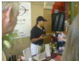
February 2008 ▶ Us! Berry Food & Wine Show Berry, N.S.W