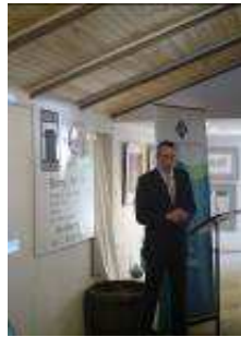
The Honourable Matt Brown Minister for Tourism and Housing Launch of the $1.5 million Tourism N.S.W Campaign at Silos Estate Berry, N.S.W.